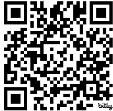
Dirty Bear (Gravel 50)