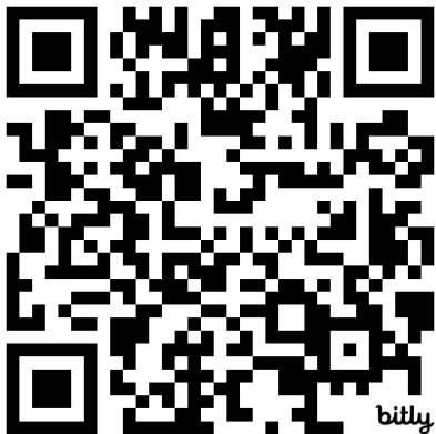
50 Mile Road Ride